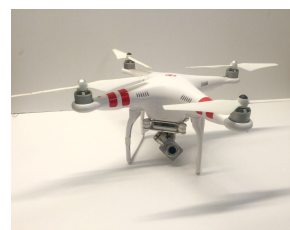
Fig. 1. A DJI Phantom 2 Vision+ drone that we used in our study

However, the extant literature mostly from legal scholarship focuses on conceptual analyses of drones and their im-